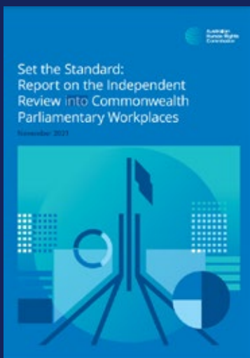
Set the Standard: Report on the Independent Review into Commonwealth Parliamentary Workplaces (2021)