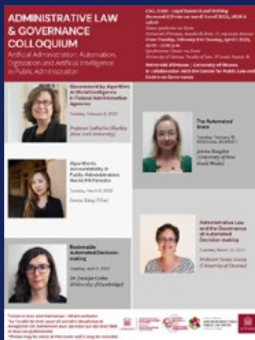
Administrative Law & Governance Colloquium 2022