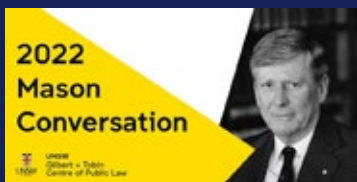
2022 Mason Conversation