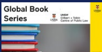
Global Public Law Virtual Book Seminar Series